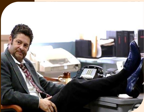
WICKED CITY (ABC Studios)