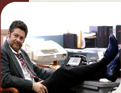
WICKED CITY (ABC Studios)